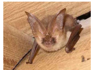
Brown long-eared bat.

Bat species which often make use of boxes include common pipistrelle, soprano pipistrelle, noctule and brown long-eared bat (pictured).