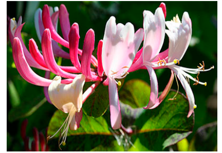
Honeysuckle attracts insect prey