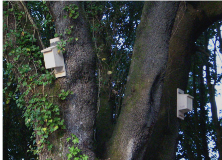
Bat boxes positioned around a tree.

Boxes must be securely fixed but use aluminium nails or attach with a strap or wire to avoid damage to trees.